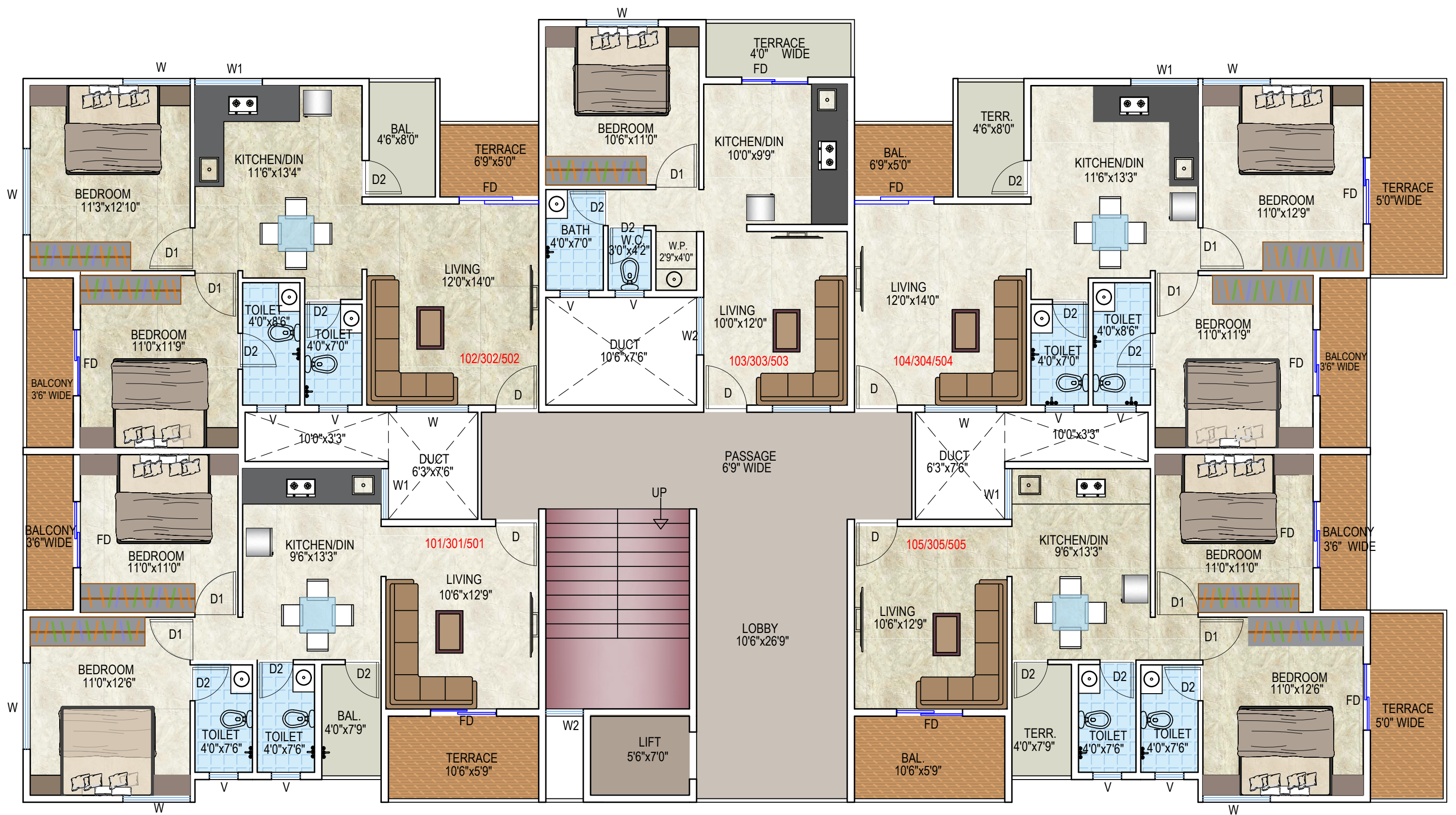
TYP. 1st(stilt floor), 2nd, 3rd, 4th, 5th, 6th & 7th FLOOR PLAN FOR BUILDING A